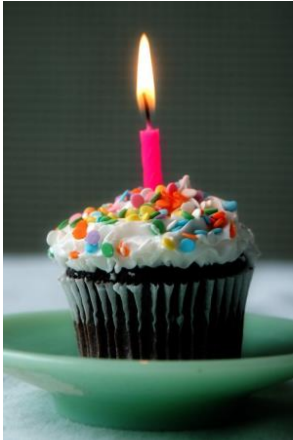
1 - We would like to wish a Happy Birthday to Cora and Zala