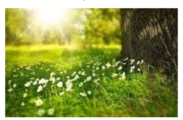
Spring Term 2 - Week 6 1st April 2022