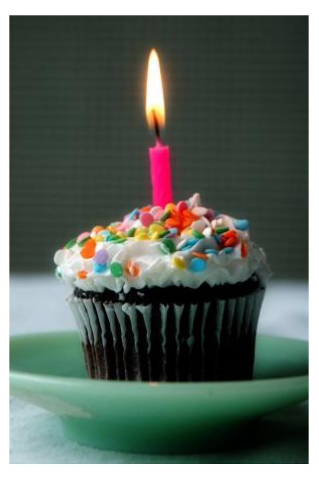
1 - We would like to wish Happy Birthday to... Joss!