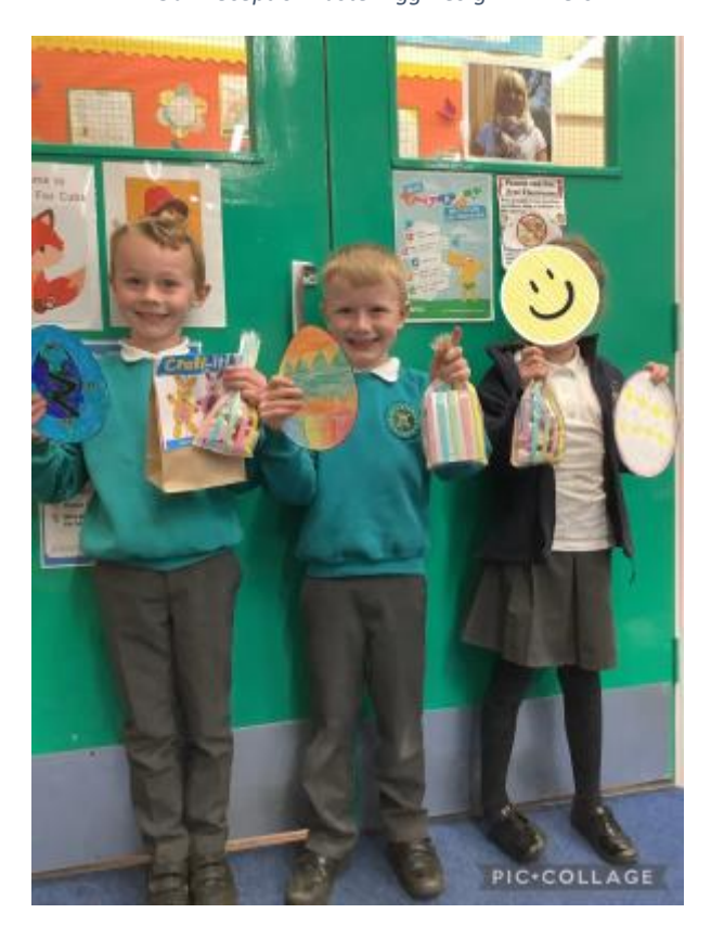
3 - Our Year 1 Easter Egg Design Winners