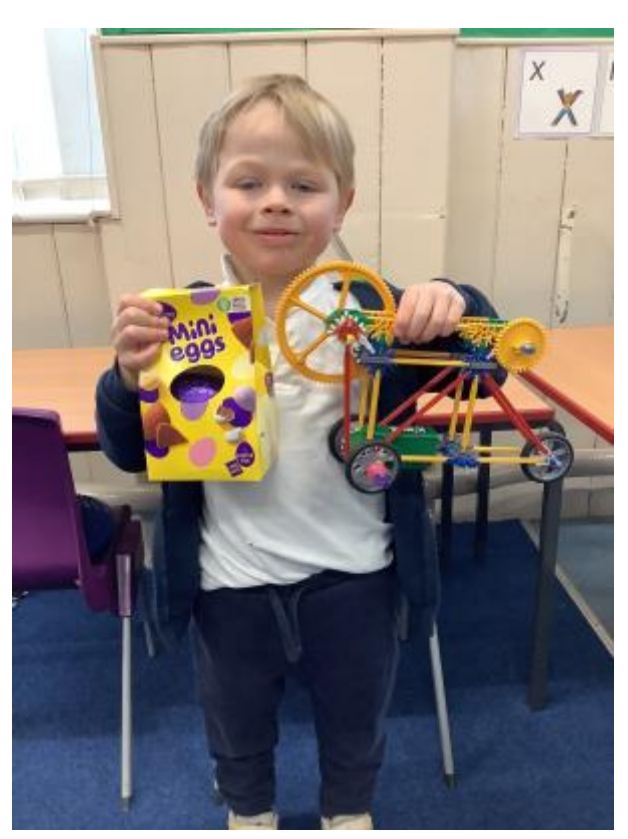
5 - Our Reception Egg Race Winner