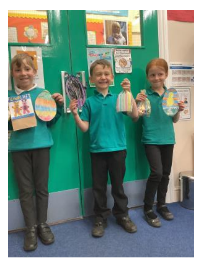
4 - Our Year 2 Easter Egg Design Winners