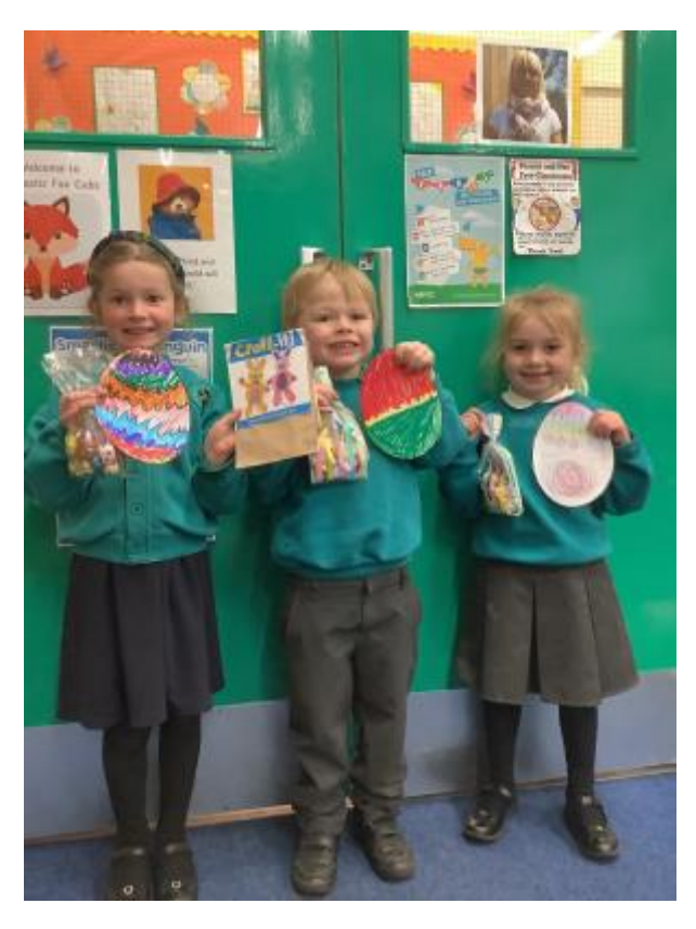
2 - Our Reception Easter Egg Design Winners