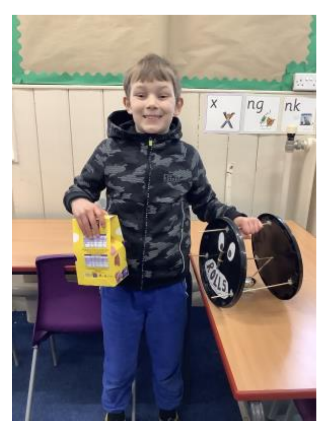
6 - Our KS1 Egg Race Winner