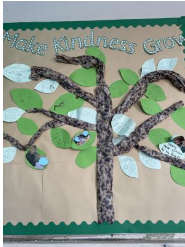
2 - Here is our kindness tree