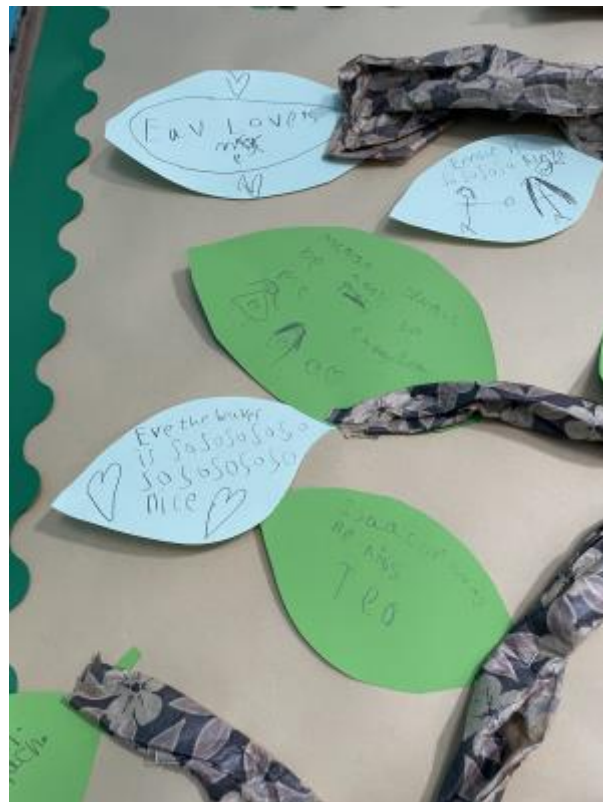
3 - We have been thinking about ways in which we have been kind or how others have shown kindness to us.