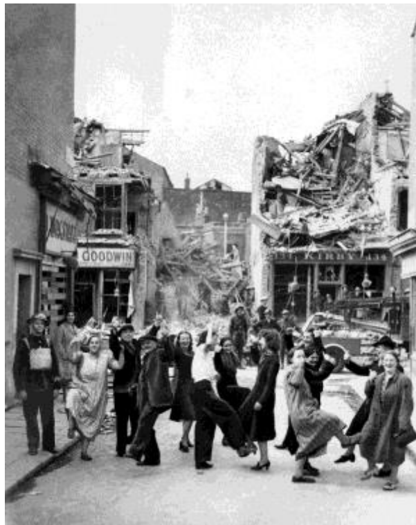
5 - We enjoyed learning the 'Lambeth walk' song & dance.