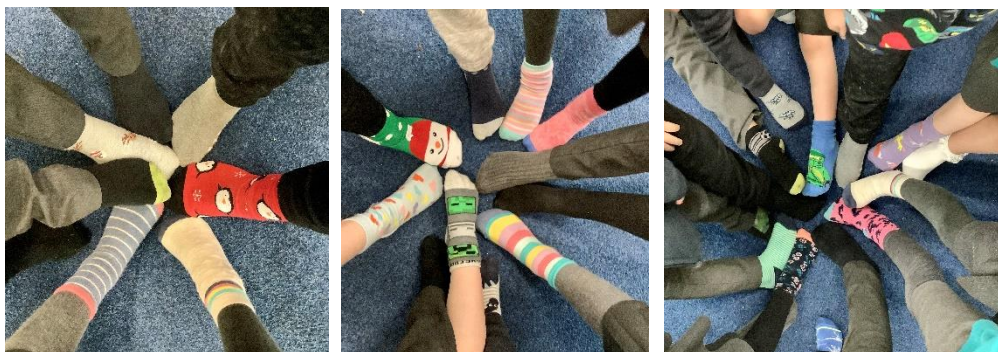
Odd Socks Day - to start off 'Anti Bullying Week.'