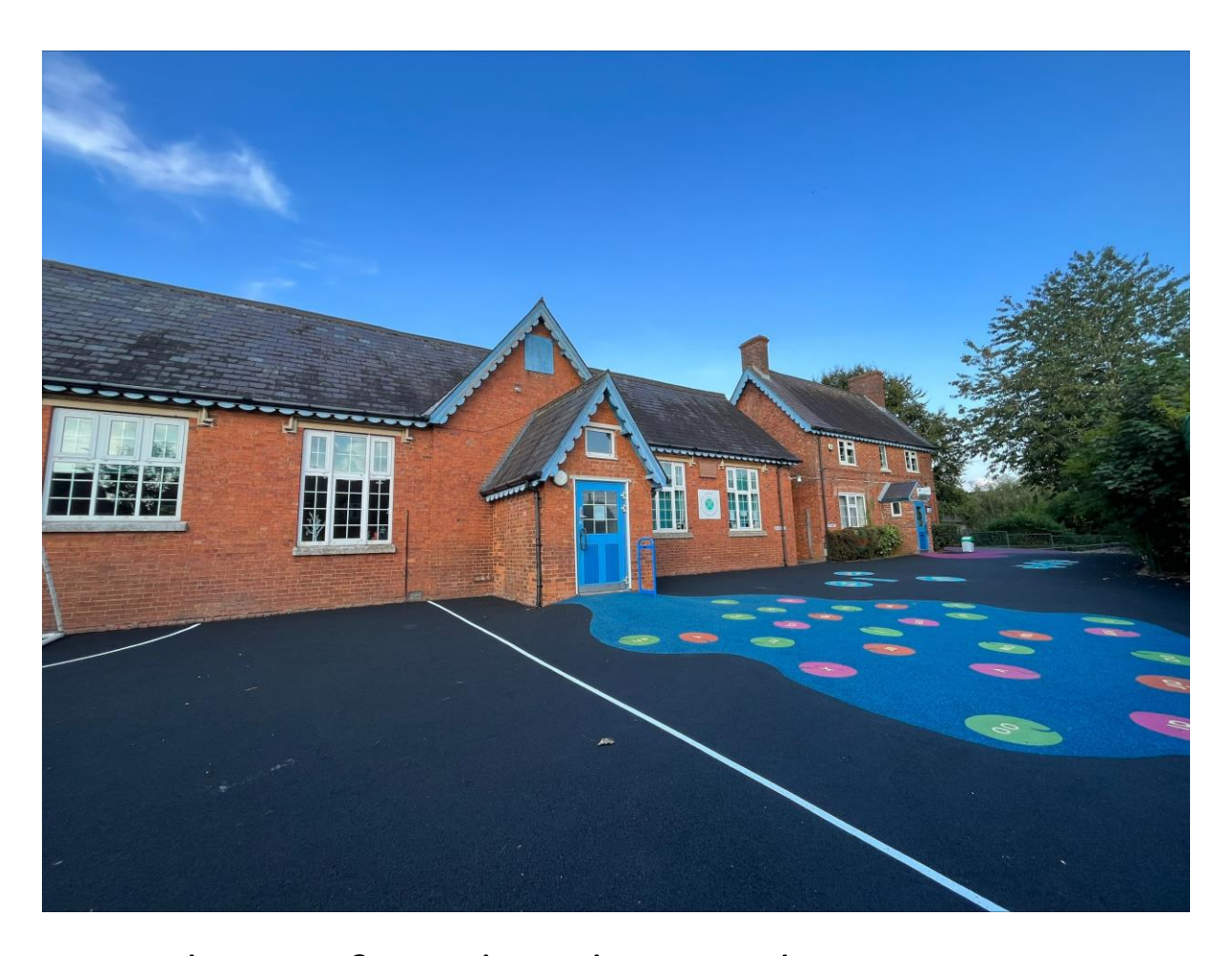
Naseby CofE School Newsletter 22nd January 2024