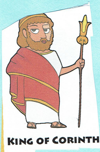
KING OF CORINTH

I believe that I rule Corinth grandly. But sometimes I think I'm a disadvantage to all the people of this city-state. But at least they have a bit of structure and I'm the perfect man for making quick decisions.