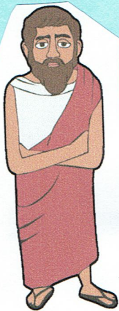
CITIZEN LIVING UNDER MONARCHY RULE

It's so unfair in life. I feel very low. Also so very small in public and all my life. I don't get a single say. I dare not refuse though.