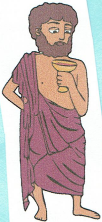
MEMBER OF OLIGARCHY

I'm very ecstatic that I am part of the group I think these rules are completely fair. It's like walking on air with all this money.