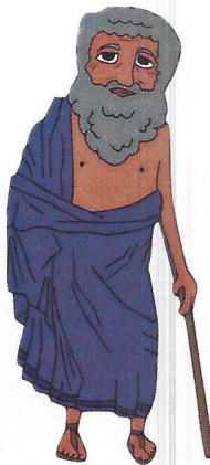
CITIZEN LIVING UNDER OLIGARCHY RULE

This is bad; the poor people are getting poorer and the rich richer, the only good thing is I don't have any people bothering annoying me for money because the army is patrolling patrolling the streets.