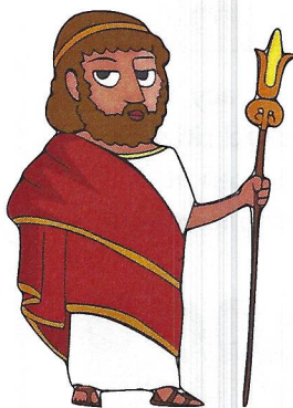
KING OF CORINTH

This is going well, Since my father died I have been King. People respect me and are happy but a few are angry.