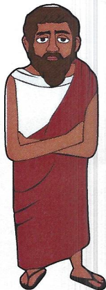
CITIZEN LIVING UNDER MONARCHY RULE

But he can make mistakes like every human, such as the taxes he put on two years ago.