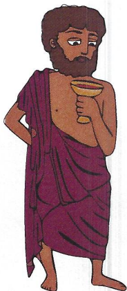
MEMBER OF OLIGARCHY

Only the poor are getting poorer and that's not good.