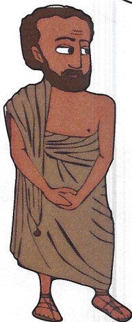
CITIZEN LIVING UNDER DEMOCRATIC RULE

I Love the way it works, Last year, I was very popular and I passed lots of great laws laws. This year though though , the councillors are bad councillors